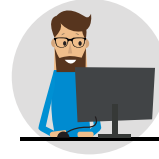
COMPANY IT SUPPORT