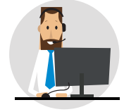
NOTARIUS CUSTOMER SUPPORT